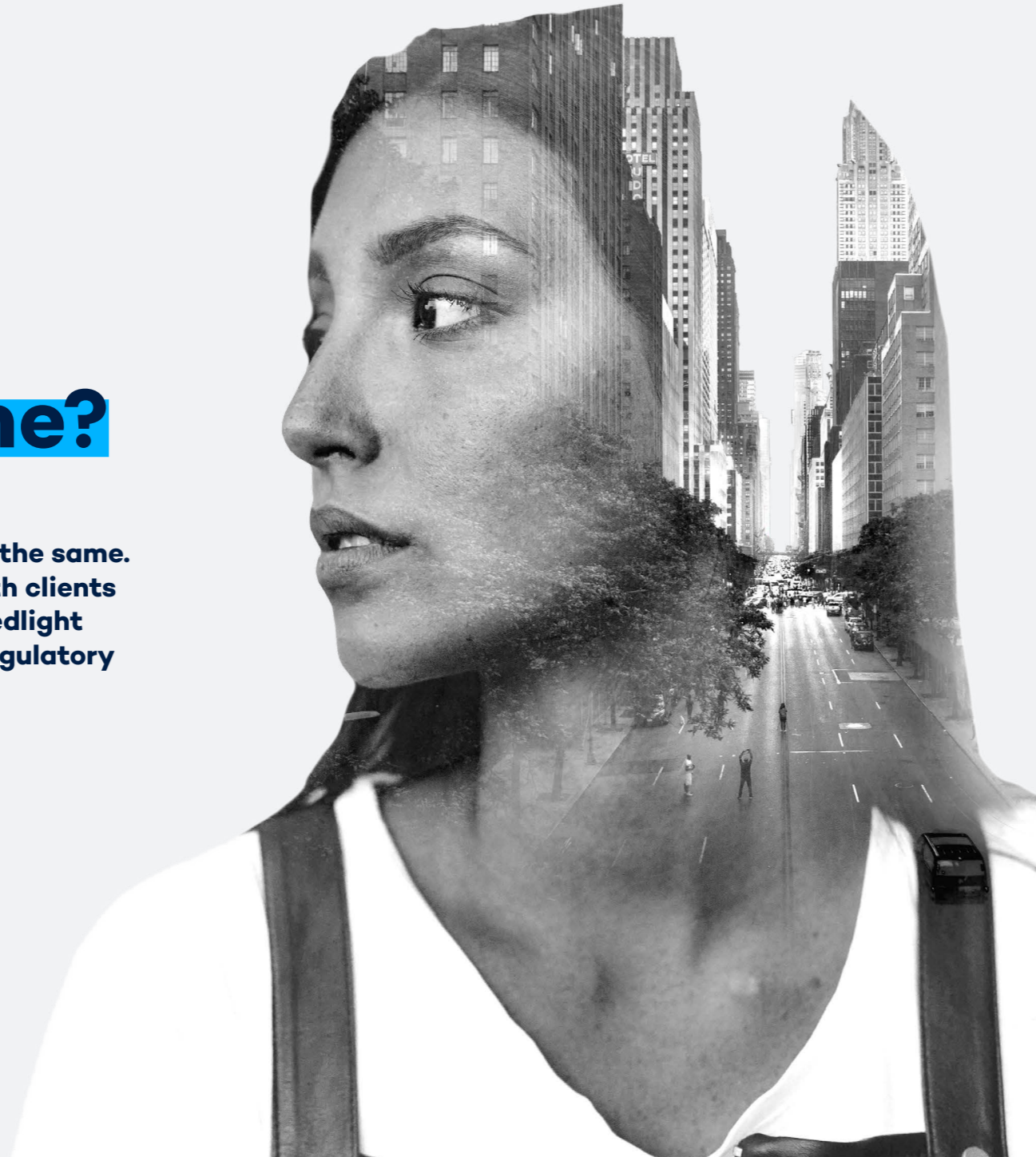
PHOTO AND VIDEO DOCUMENTATION

We know not all roads are built the same. That's why VITRONIC works with clients to custom build a POLISCAN Redlight system that fits their unique regulatory requirements.