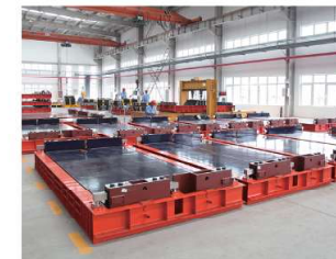
WIM scales in WanJi manufacturing base