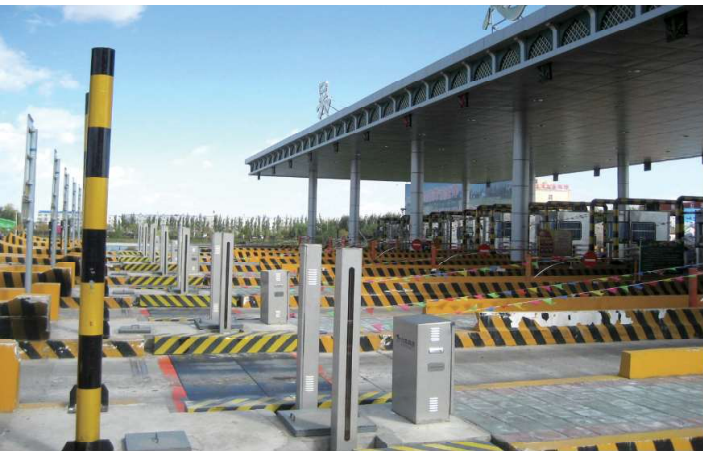
Wanji WIM system in toll station Guangdong, China which consists WIM scale, infrared separator and deductive loop