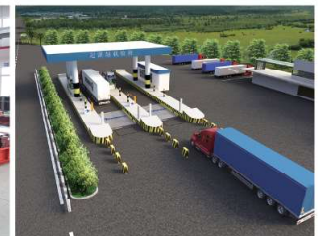
WanJi products in WIM station