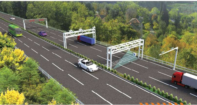
WanJi WIM direct enforcement system

WanJi WIM Direct Enforcement System is to regulate overloading truck in free flow situation with the speed 0-130 km/h. This all-inclusive WIM Direct enforcement solution includes high-speed weigh-in-motion system, LIDAR, ANPR, the traffic video monitoring system and WIM data management platform. This system collects not only accurate truck weight data but also the complete chain of legal evidence to perform weight enforcement. The front part of the system (the weighing system and LIDAR system) would collect vehicle information including axle weights, gross vehicle weights, vehicle type, axle number, axle distance, single or dual tire, date and time, location, plate number, speed, vehicle driving direction to the platform. Based on these data, the platform can automatically determine whether truck is overloaded or not. The policemen do not need to stop the trucks one by one in the highway but only to stop the targeted trucks. The direct enforcement method improves the efficiency of weighing system significantly.