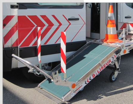
Ramp & toppling bar