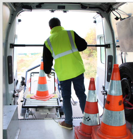
Operator working at ergonomic height, protected inside the vehicle from traffic