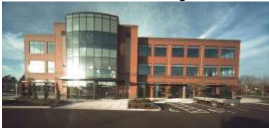
Rectilinear wide angle lens

The two families of wide angle lenses create very different views of the world.