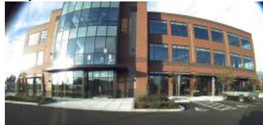
Barrel distortion wide angle lens

Most wide angle lenses including fisheye lenses have barrel distortion which comes from imaging equal angular slices of the world onto the sensor. A close kin, similar in application but different design, is to image equal planar distances in the real world onto the image sensor using a rectilinear lens. Until recently, rectilinear lenses were not available for wide angle applications. Theia Technologies has worked to develop this type of lens .