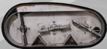
3x 40cm Spray Bars (122cm)

PTO AND AUXILIARY ENGINE DRIVEN - AVAILABLE ON THE CHASSIS OF YOUR CHOICE