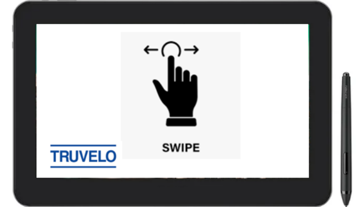
Dash-mounted touch screen interface