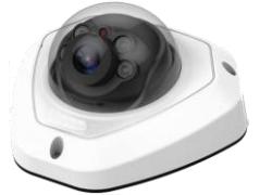
Dome camera; CCTVL, CCTVR