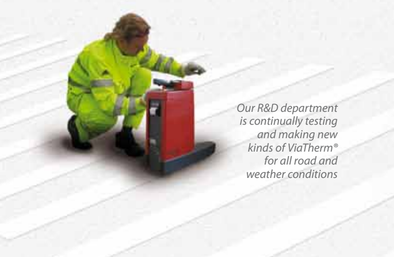
Our R&D department is continually testing and making new kinds of ViaTherm® for all road and weather conditions