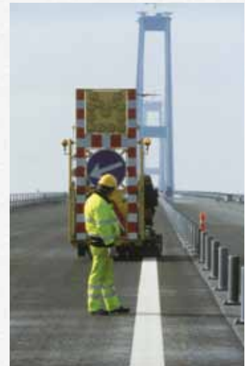
ViaTherm® is used for standard and special markings