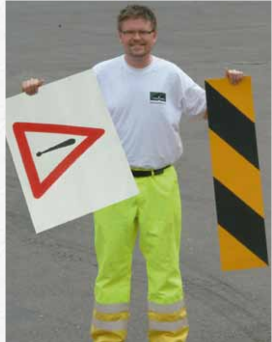
In this example, PREMARK® Easy is shown

So choose PREMARK® whenever you need proper, flexible, high-quality road marking made of preformed thermoplastic.