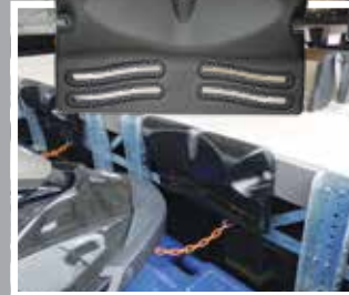
BOAT & PWC BOW GUIDES