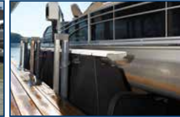
Optional ring mooring kit