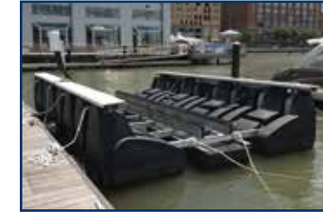
Simply tied to the dock