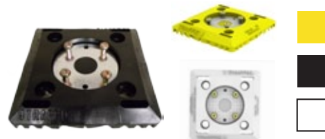
8" L x 8" W x 1" H

Available in Fixed or Quick Release. Installed with 4 anchors. Colors: Yellow, black & white.