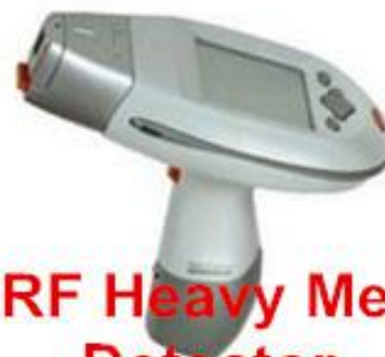
XRF Heavy Metal Detector