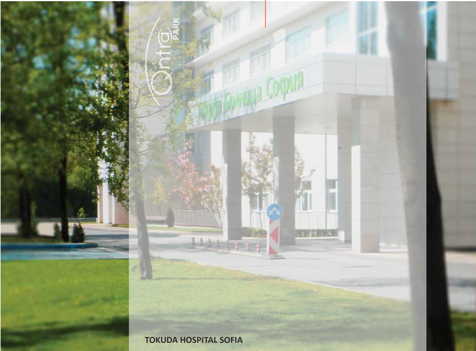
TOKUDA HOSPITAL SOFIA