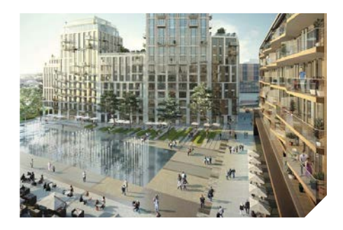
London Docklands, UK Installation of 5000m<sup>2</sup> of paving