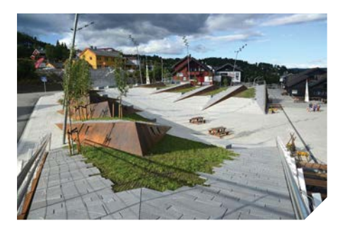
Geilo ski resort, Norway Installation of 800m<sup>2</sup> of paving