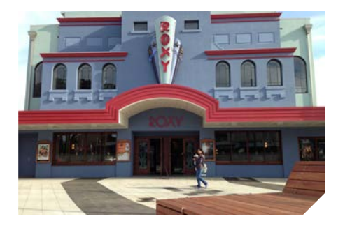
Roxy Cinema, New Zealand Installation of 700m<sup>2</sup> of paving