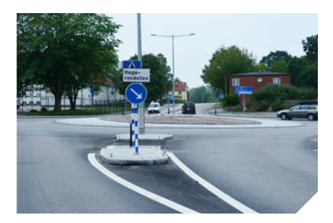
Alvesta, Sweden Installation of 2300m<sup>2</sup> of paving