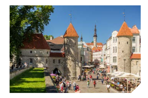
Tallinn Old Town, EstoniaInstallation of 8000m² of paving