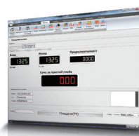
MANAGEMENT SOFTWARE QPS PARK