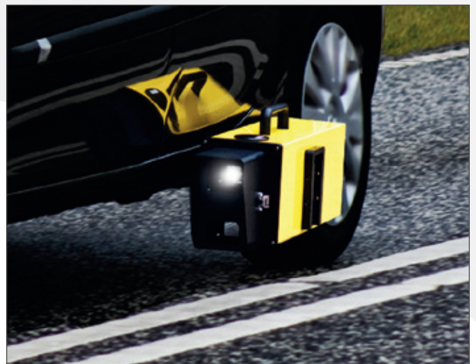
Road marking reflectivity surveys