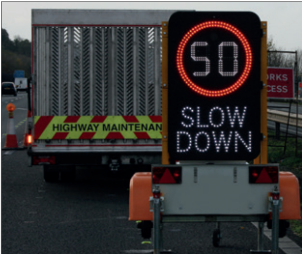
Portable Speed Radar