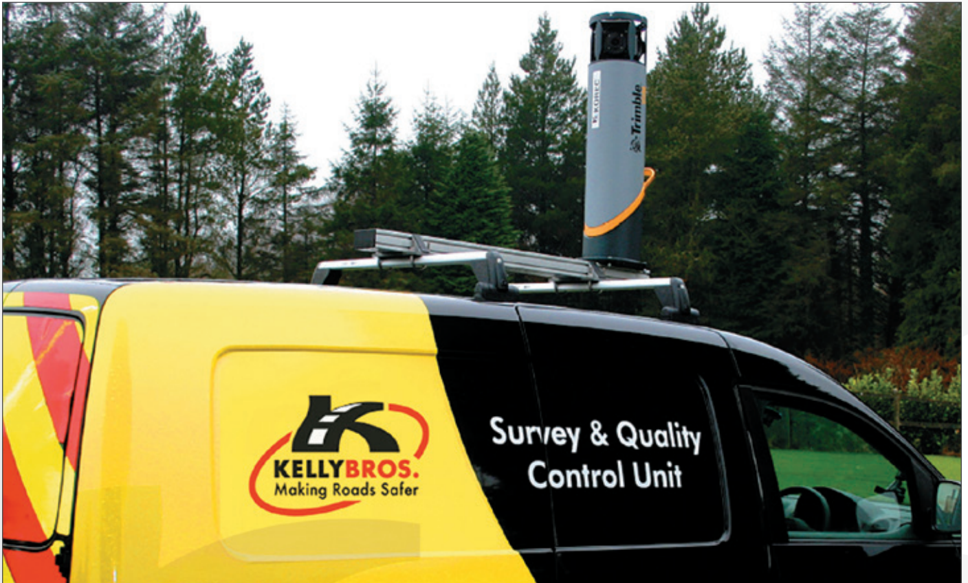
360 degree imaging surveys