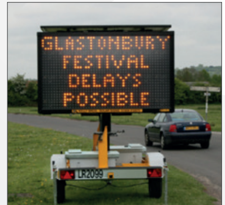
Lift & Rotate