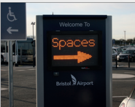
Permanent Mounted VMS