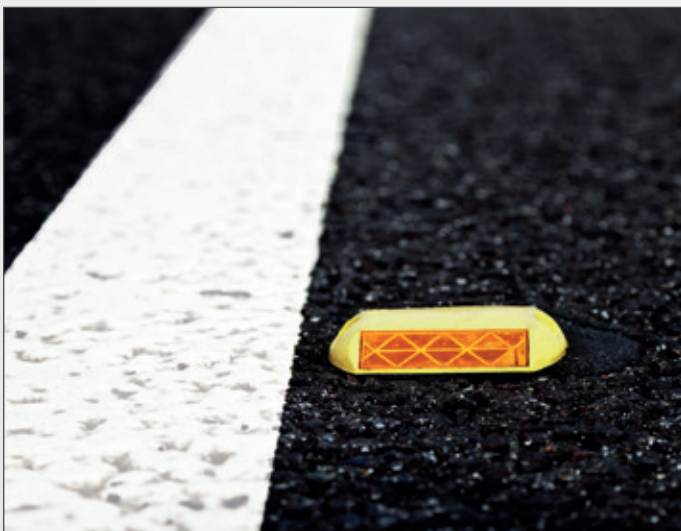
Cat's eye reflectivity surveys