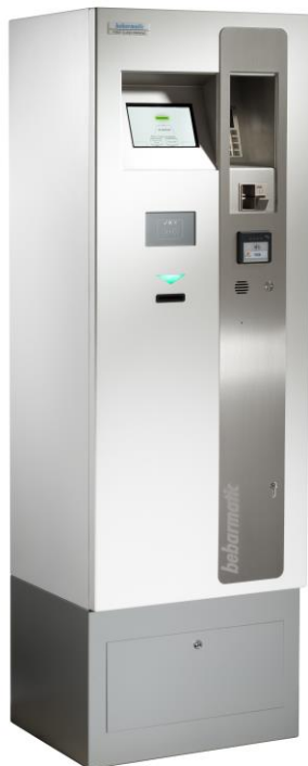
Vorderansicht Kasse Front view cashier