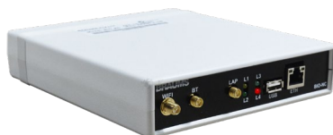
BIO-R / RC unit

This model is designed to be installed standalone and derive its power from a 50 Watt Solar Panel system with battery that can be pole mounted. This model is also fitted with a cellular modem and is able to communicate with the server. This unit only requires a fixture location so can become quickly operational (within 15 minutes of fixing).