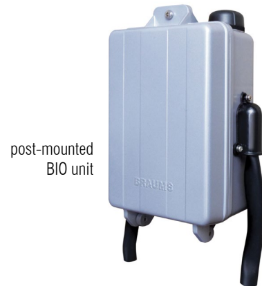
post-mounted BIO unit

The sensors have a typical coverage of approximately 100 meters subject to local conditions and location of the antenna. The collected data can then be sent to the server via an Ethernet interface onboard if the BIO is connected to a local broadband router or via a Cellular link (3G, 4G and soon 5G).