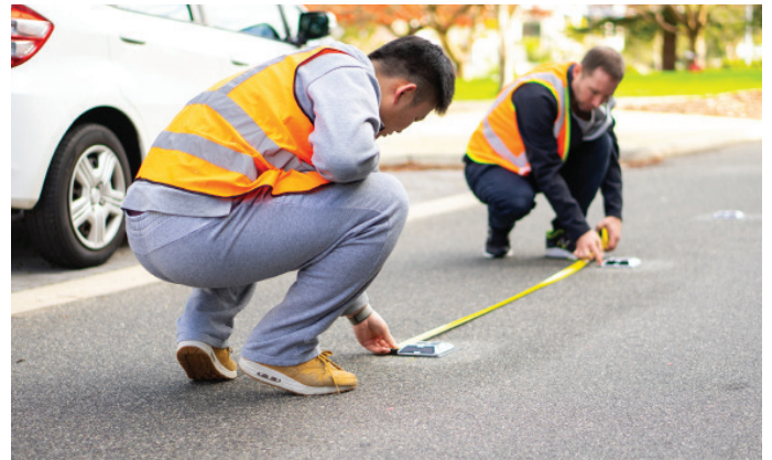
Installation is quick and easy. Taking the time to position the magnetometers in a precise array ensures optimum data quality.

This method allows installation to occur quickly, with little to no traffic management or cutting/ grinding of the road surface and ensures longevity of each RoadPod VM on the road.