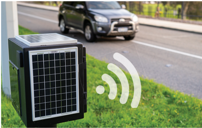
The RoadPod VM Gateway is solar charged & sits in a waterproof cabinet by the roadside, transmitting raw data to the Cloud.

RoadPod VMs work in an array to accurately count vehicles, monitor speeds and classify vehicle type based on the length of each passing vehicle. Gap and headway information is also available and all data is precisely time-stamped.