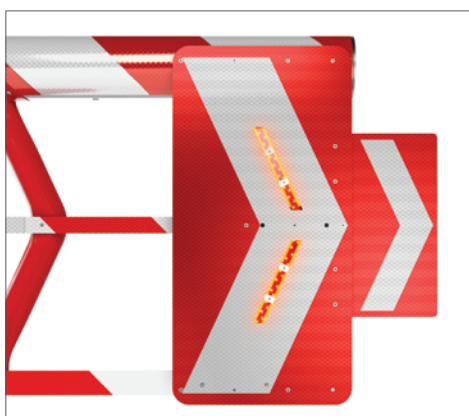
Gate chevron with flashing LED lighting