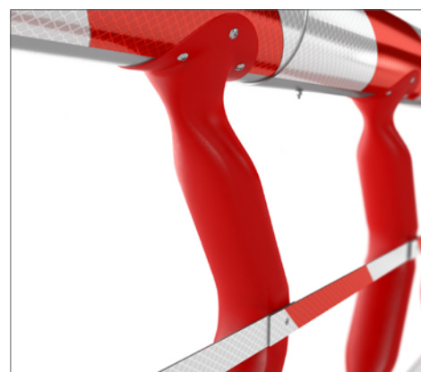
Flexible high density polyethylene arrow shaped posts